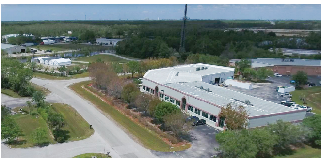
Our Fort Myers location includes the main facility for R&D, production and testing (the light gray building) as well as our testing yard in the background with the white structures and test hill .