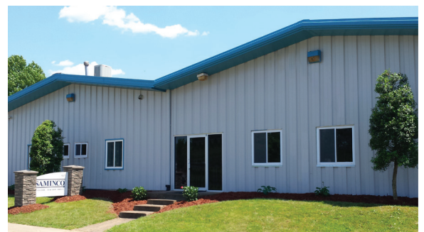
Our Huntington, WV facility includes our panel shop, rebuild / repair workshop, and motor warehouse.

Ph: 239-561-1561 • Email: sales@samincoinc.com • Web: www.samincoinc.com