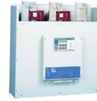
230V - 1000V Starter Modules