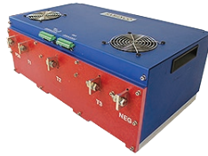
VF Series Tram