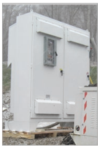
230V - 600V Outdoor VFD