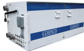
230V - 1000V