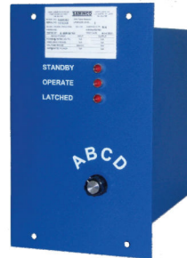
A800392 GF Detection Receiver