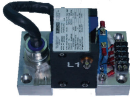
A800203 Ground Fault Detection Diode Assembly

For DC TRAILING CABLE POWERED SHUTTLE CARS (DC/AC (VFD) or DC/DC) 200VDC - 600VDC