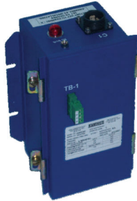
A800390 GF Detection Transmitter