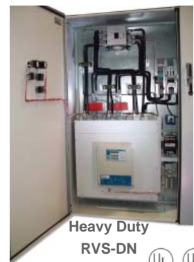
Heavy Duty RVS-DN

Other enclosures and accessories available