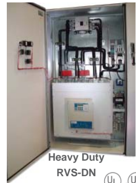
Heavy Duty RVS-DN

Other enclosures and accessories available